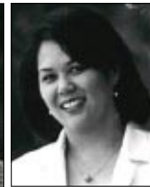
Dr. Lee Family Practice